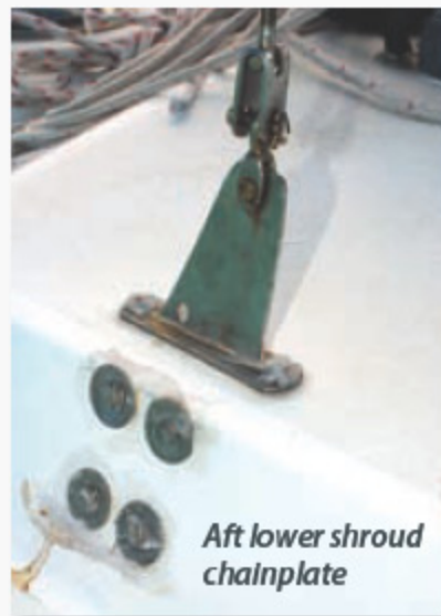
Aft lower shroud chainplate