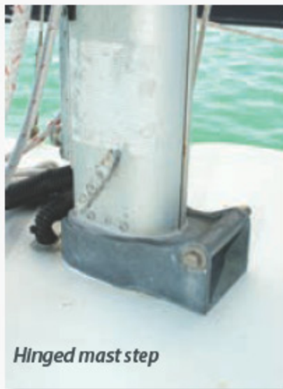
Hinged mast step

When under sail, the jib-sheet trimmer sits aft of the tiller, giving the helmsman a clear view ahead. But no matter the seating arrangement, leg room for four adults is tight.