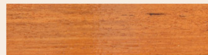
HMG Coma Berenice