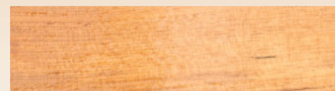
Coelan without primer