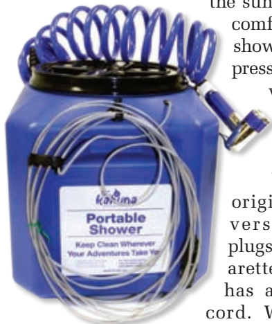
Big Kahuna Portable Shower

Our search for a portable shower for Jelly , our Catalina 22 project boat, led us to the Big Kahuna portable shower. The shower features an integral tank, a 12-volt pump, and a trigger spray nozzle. After a few hours in the sun, it provides a comfortably warm shower with more pressure than conventional solar bags that you hang from the rigging.