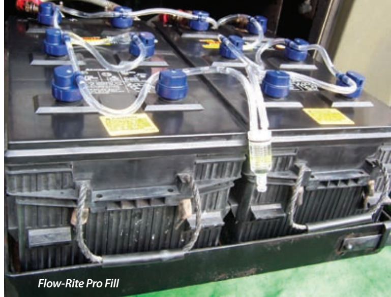
Flow-Rite Pro Fill