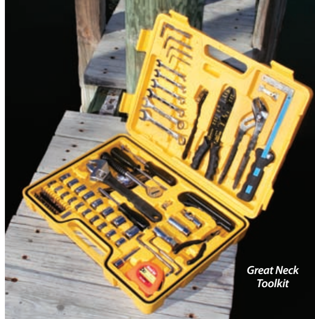
Great Neck Toolkit

Why anyone has yet to come up with an off-the-shelf tool kit that meets the need of the cruising sailor is a mystery to us. Sure, even the best kit will need to be supplemented with specialized tools, but you'd think someone would develop a kit that caters better to sailors' needs. In our last test of off-the-shelf products (March 2002), kits from Craftsman and Sea Choice edged out those from U.S.-based Great Neck. We've had the Great Neck 125-piece mariner's kit on board one of our test powerboats for over two years now, and it met our routine maintenance needs on all but two occasions, once when we needed vice grips and another when repairs called for a deep socket. The box is holding up, and the tools